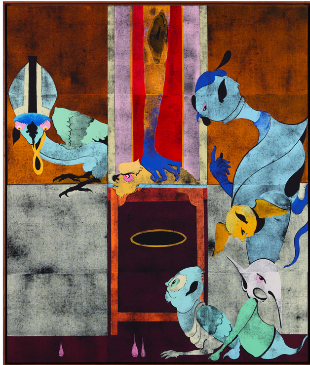
© Gert & Uwe Tobias, Random Rules, 2021 (détail)

The Louis Roederer Foundation is deeply committed to supporting contemporary creation and the transmission of knowledge. Its scope embraces both artistic practices and research, celebrating thought and gesture alike, and exploring what we share universally: words, music and images - across literature, music, the performing arts, and visual and plastic arts. At the heart of its support and actions lies a desire to bring creation and knowledge into dialogue, to build bridges and create resonances across disciplines.