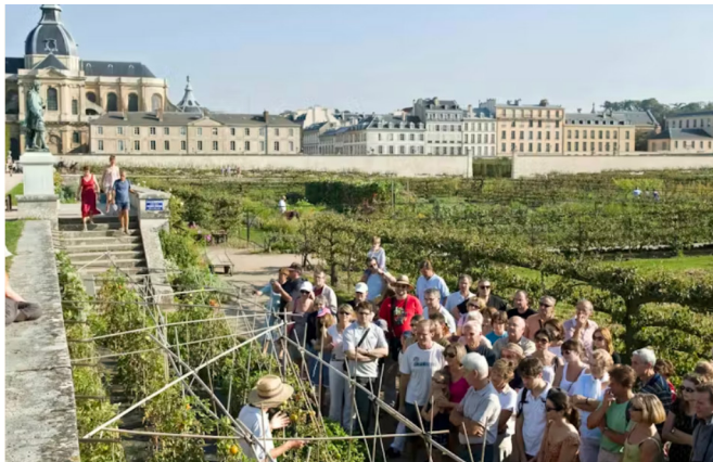
Domaine du Rayol

Beyond the quality of the projects developed by these two organisations, the aim is to extend the Foundation's reach both internationally and regionally, in a continuous dialogue between thought, creation and action.