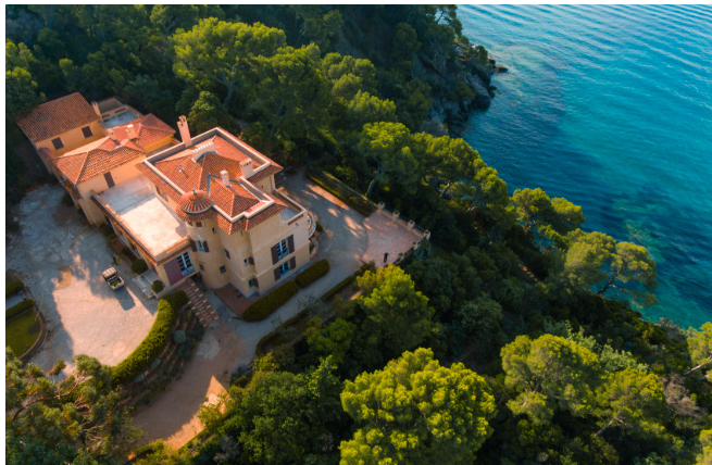
World Monuments Fund

in Cassis in southern France, this residency invites a thinker — an American writer — to explore, through writing, their intimate relationship with the world. Unlike the Thinking Sustainability Prize and Research components, which are grounded in scientific work, " Habiter le monde " gives space to experience, perception and imagination. Hosted for three weeks at the Camargo Foundation's property in the heart of the Calanques National Park, the author will produce a text to be included in the programme's publication.